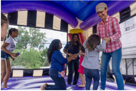
Staff, clients, and their families enjoy the family-friendly activities of our third summer carnival.