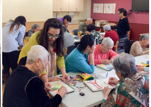
Through the Seniors Community Hub, Skills for Change provided seniors with speed networking and mentoring events (on the left), health and wellness workshops (on the right), financial literacy information sessions, and more.