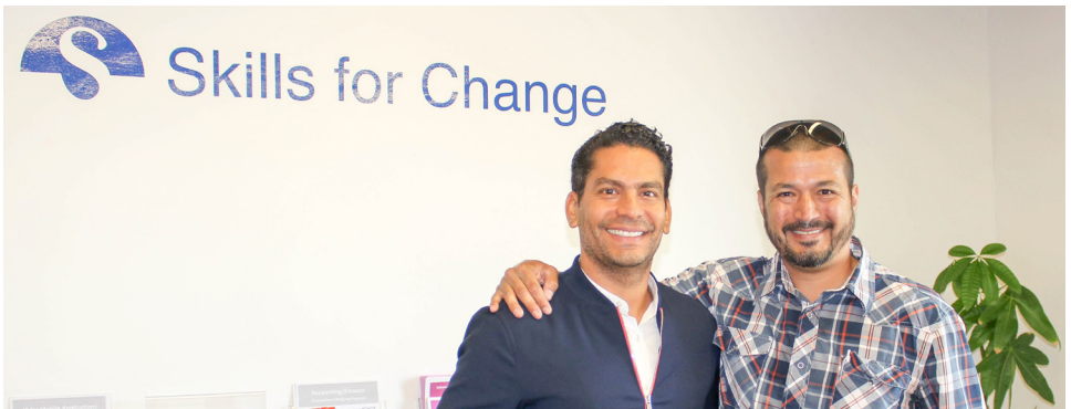
Ismael Cala shared his story and took pictures with clients during his visit to Skills for Change's head office.

- ISMAEL CALA IS A JOURNALIST, WRITER, PRODUCER AND PRESENTER OF RADIO AND TELEVISION. HE IS INTERNATIONALLY RECOGNIZED FOR HIS PROGRAMS AND IS A LECTURER AND MOTIVATIONAL SPEAKER. HE CURRENTLY HAS 4.5M FOLLOWERS ON TWITTER AND FACEBOOK.