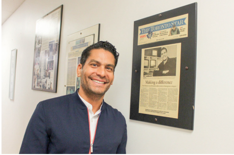
Ismael Cala visited SfC's head office earlier this year.