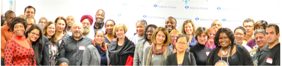
On December 8th 2016, Skills for Change held the “Celebrating Kindness across the City” event, in which new and current mentors/mentees had the opportunity to connect and share inspiring stories.

“I am grateful to my mentor and Skills for Change staff who have big hearts and generously provided advice, encouragement and personal referrals to job seekers like me. I hope the program continues to be successful!”