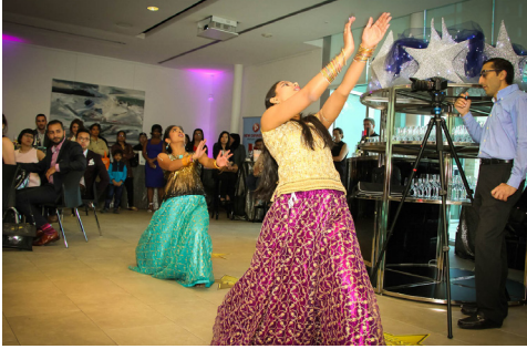
Bollywood-style performance at the 2016 Pioneers for Change gala.