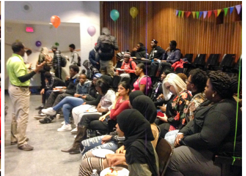
On February 11th, 2016, we launched the Pathways to Success program at Westview Centennial Secondary School (pictures above). Throughout the program, participants were provided with guidance and support on many topics.