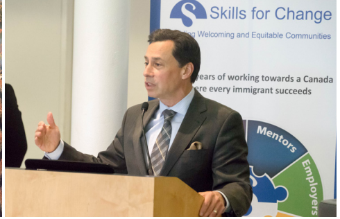
MPP Brad Duguid makes the initial remarks.

Diversity@Work 2017, themed “The Changing Faces of Workplace Diversity” saw 200 business professionals attend and participate in the full day conference. Hon. MPP Brad Duguid, Minister of Economic Development and Growth opened up the event with welcome remarks, followed by an enlightening keynote address by Denise Balkissoon, journalist and editor for the Globe and Mail. Evaluations collected of attendees’ experiences were extremely positive, stating the high calibre of speakers, the relevant content and overall organization.