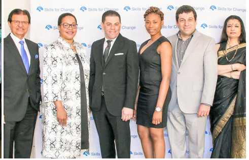
2016 Pioneers for Change's award recipients united.