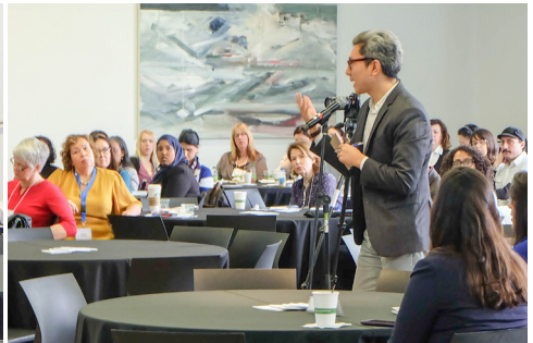
Attendees interact with guest speakers at the conference.