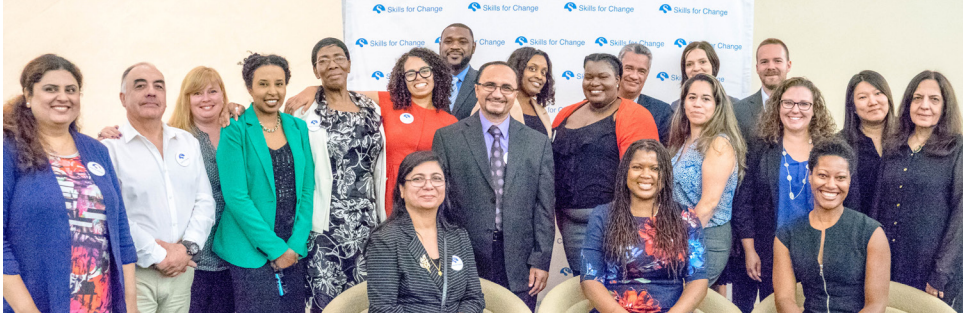
Skills for Change's staff at the 2016 Annual General Meeting and Business Leadership & Partner Appreciation Awards.

The 2016 Annual General Meeting and Business Leadership and Partner Appreciation Awards was held on Thursday, September 22nd at the Toronto City Hall.