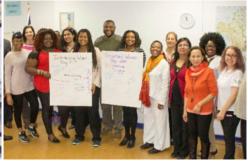
Staff participates in the International Women's Day wellness session at Skills for Change's head office.